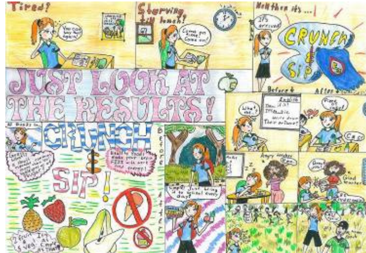
Polina's 'before and after Crunch&Sip®' entry