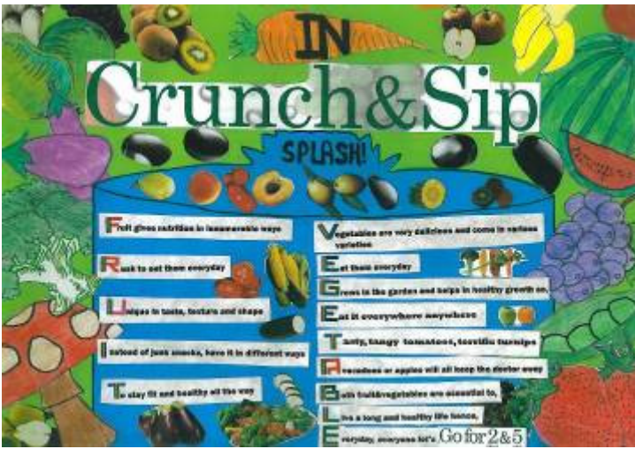
Zeba, year 5, Willetton PS